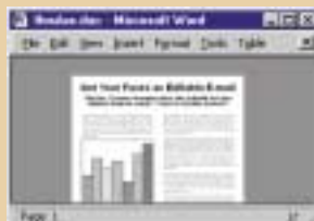
Formatted MS Word™ document of your fax