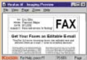
The original fax image