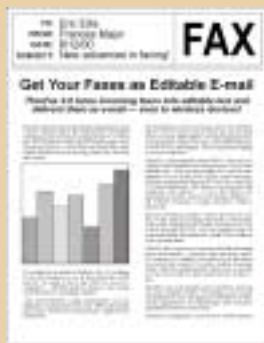
Original fax image